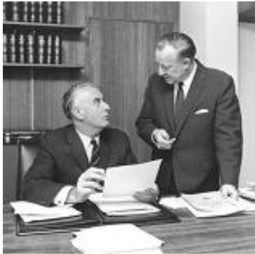
duumvirate government (means ministry of two)

"Be it enacted by the Queen's Most Excellent Majesty, the Senate and the House of Representatives of the Commonwealth of Australia .."