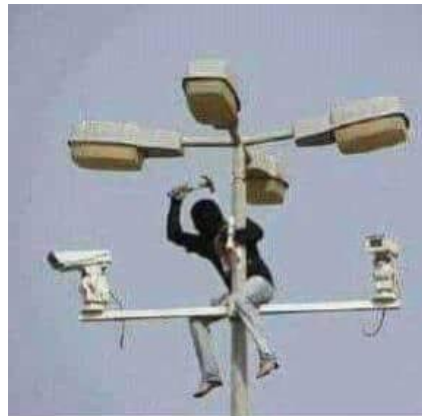
Me doing repairs around the neighbourhood