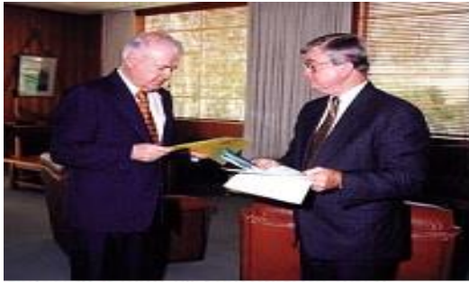
Former Electoral Commissioner Bill Gray returns the writs for the 1999 referendum to the Governor-General, Sir William Deane.

No States recorded a YES vote. Nationally 39.34% of electors voted YES.